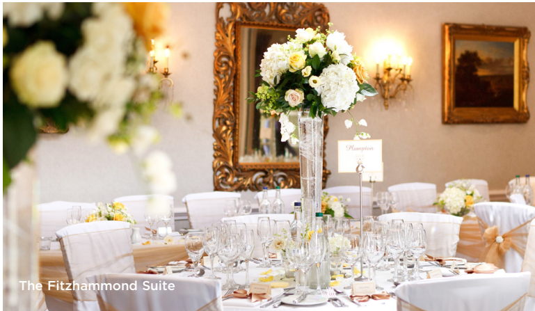
The Fitzhammond Suite