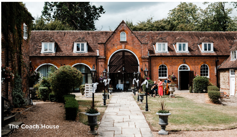
The Coach House